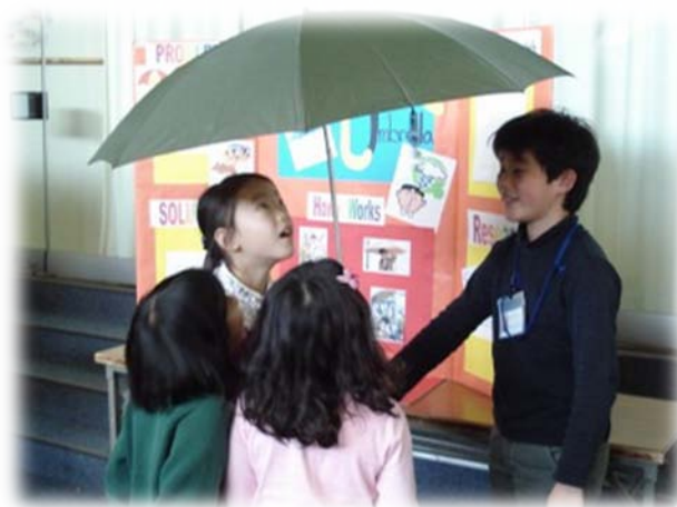
A student captivates his classmates with his invention

If you happened to be in Nagoya, Japan, mid-March and were in search of a product that could solve one of your nagging problems or fulfill a desperate need, you could have browsed an array of original inventions made by fifth graders at Nagoya International School (NIS). The annual NIS Grade 5 Invention Convention, sponsored by Raytheon, with attention-grabbing items like an automatic shelf, a homework reminder and portable desk, wrapped up just before the spring break vacation.